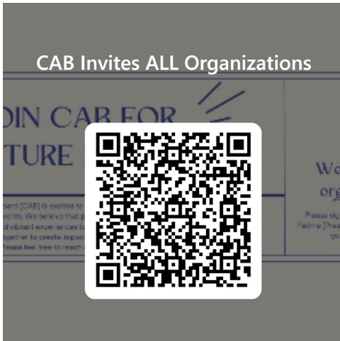
CAB QR code for collaborations for Halloween Bash or other events