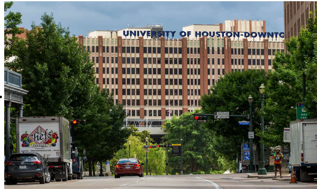
One Main Building