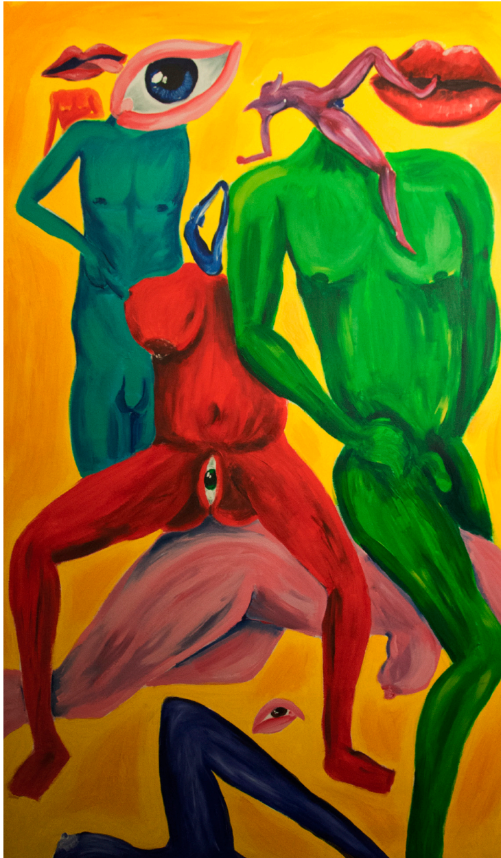
LOVERS NO.2 Alana Costello Acrylic 6'x5'